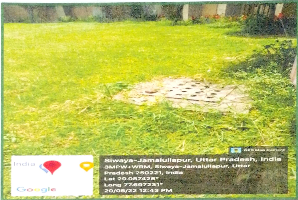
Tanks for rain water harvesting from the buildings