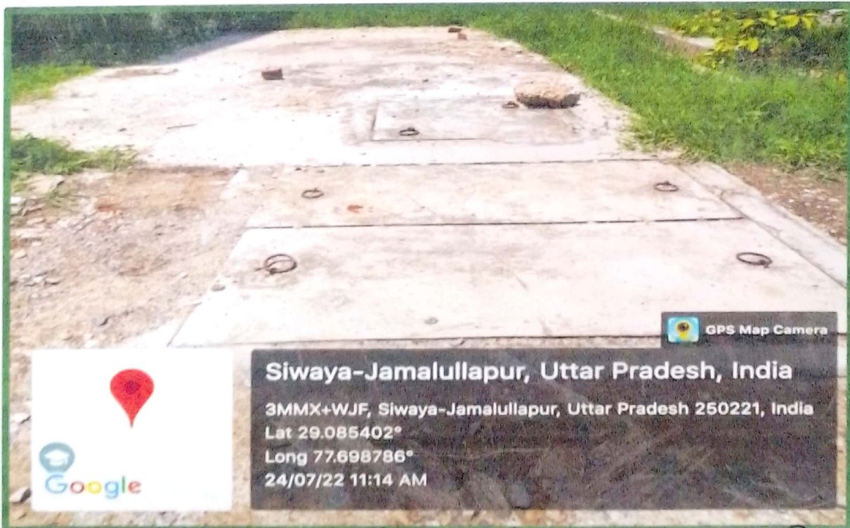
Rain Water collection Tanks in the university