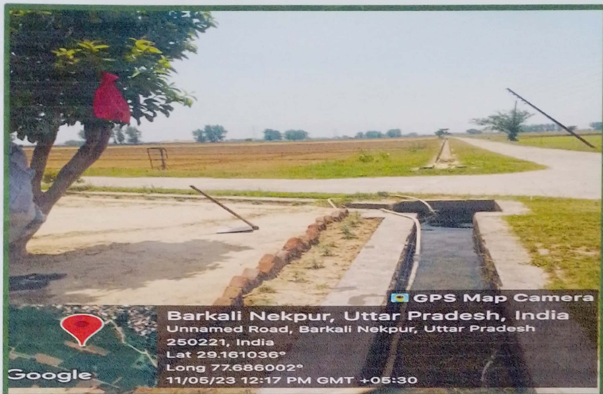
Cemented channels for irrigation to reduce water loss