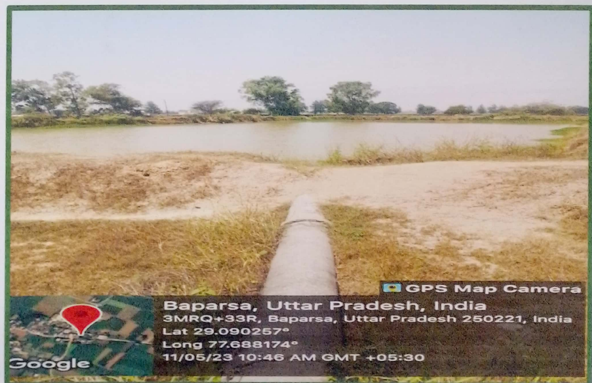
Water harvesting facility